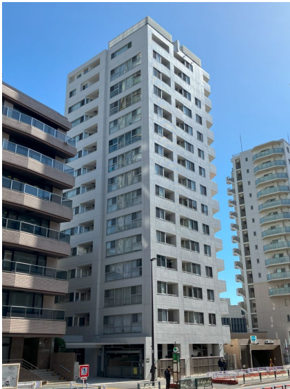
Shibuya, Tokyo Property

IREF I will continue to identify investment opportunities across diverse asset classes, including residences, offices, hotels, logistic facilities, retail spaces, and R&D centers, and contribute to future urban development. We will also actively pursue investment opportunities in Tokyo and other potential high-growth cities in Japan.