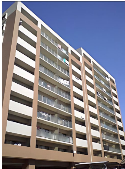
Hakata, Fukuoka Property