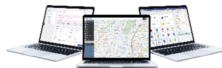
Operational support services for real estate agents

At Home Co., Ltd. (Note) Website: https://www.athome.co.jp/corporate/en/