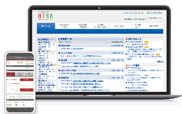
ATBB Comprehensive real estate operation support website